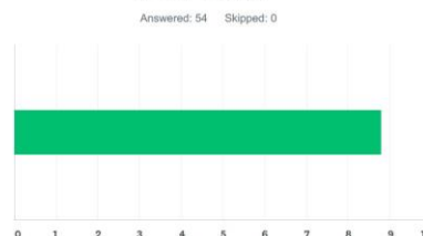
Feilding Golf Club Members Survey

Q13 How likely are you to recommend Feilding Golf to friends or family as a club to join?