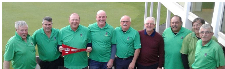
Feilding Presidents Trophy team – Winners 2018 - congratulations.

Members are reminded that Membership cards are required to be carried when the bar is open, and that all visitors who are not reciprocal golf club members are required to be signed in by a club member.